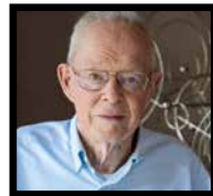
EUGENE N. PARKER

EUGENE N. PARKER , born 1927. S. Chandrasekhar Distinguished Service Professor Emeritus, Department of Astronomy and Astrophysics, Enrico Fermi Institute, University of Chicago, IL, USA, “ for pioneering and fundamental studies of the solar wind and magnetic fields from stellar to galactic scales ”.